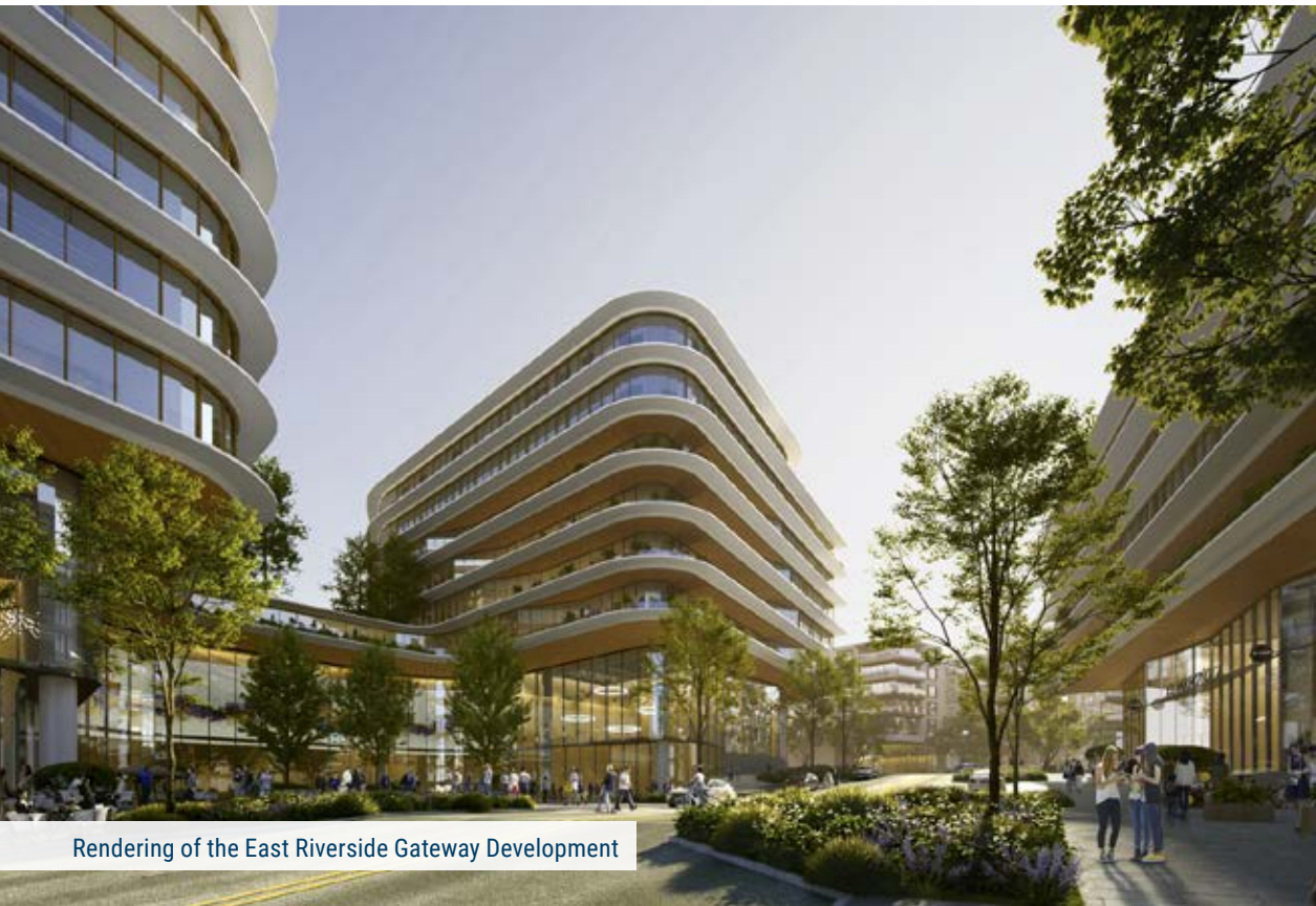
Rendering of the East Riverside Gateway Development