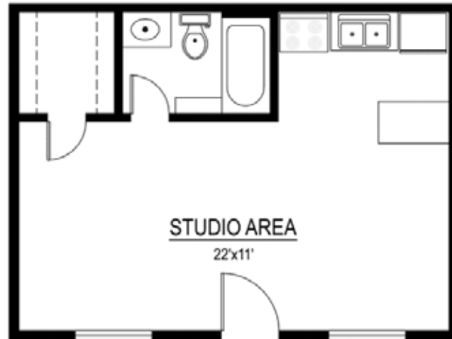
STUDIO - 400 SF